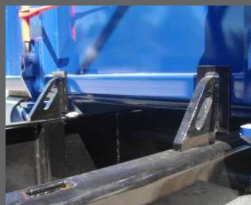
Moveable container stoppers with heavy duty pockets.