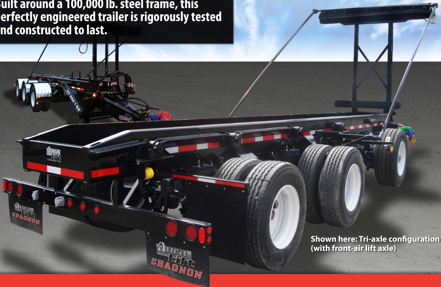
Shown here: Tri-axle configuration (with front-air lift axle)

Built around a 100,000 lb. steel frame, this perfectly engineered trailer is rigorously tested and constructed to last.