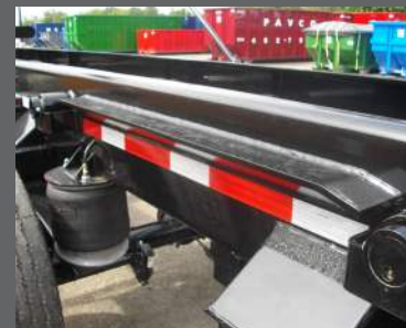
Flat plates between rollers for better support and an easier glide.