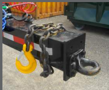
Rigid mount Holland drawbar (DB-060FQ1).