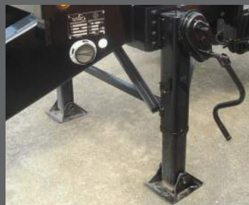
2-speed Holland manual landing gear.