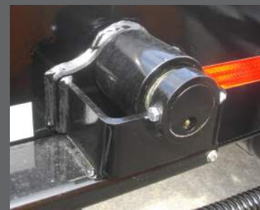
5" side rollers with bronze aluminum bushing.

Example of tri-axle configuration with hydraulic roll-off tilt frame.