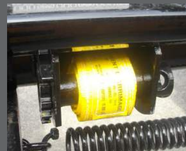
Container hooks and straps (compliant with NSC standard 10).