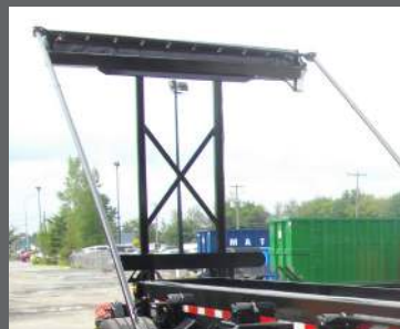
Optional 12 V electric roll-tarp system with torsion springs.