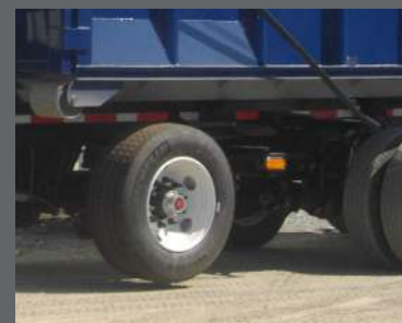
Optional air lift axle.