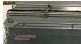
Stainless steel piping