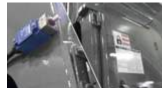
Security switch when opening the access door