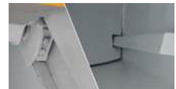
Nylatron and UHMV wear pads on all carrier tracks are accessible from the inside of the packer body and replaceable in under 2 hours