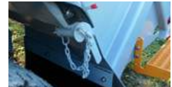
Tilgate locking system