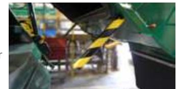
Safety prop for maintenance