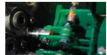
Fast idle engine speed automatically engaged