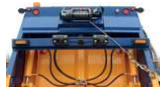
12 000 lb winch / big engine - 16' of cable extension