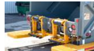
Single or dual cart tipper