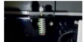
Body attachment to the chassis