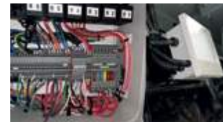
Centralized junction box.