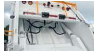
3 1/2 " x 5 " bore with chrome rod interchangeable cylinders (4x)