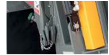
Tilgate locking system