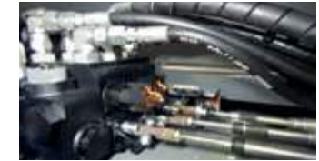
Packer valve remotely controlled