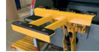
Single or dual Duralift Cart Tipper available with American or European grip