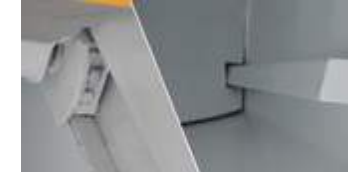
Nylatron and UHMV wear pads on all carrier tracks are accessible from the inside of the packer body and replaceable in under 2 hours