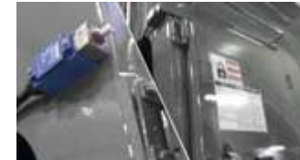
Security switch when opening the access door