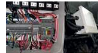
Centralized junction box.