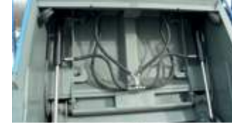
2 1/2" bore with chrome rod interchangeable cylinders (4x)