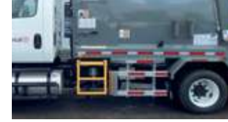
Ladder and optional side guard