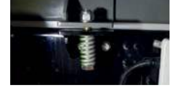
Body attachment to the chassis