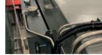
Stainless steel piping