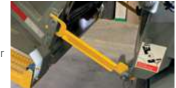
Safety prop for maintenance