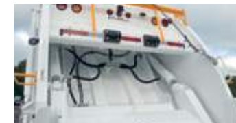
3 1/2 " x 5 " bore with chrome rod easily replaceable cylinders (4x)