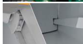
Nylatron and UHMV wear pads on all carrier tracks are accessible from the inside of the packer body and replacable in under 2 hours