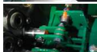
Fast idle engine speed automatically engaged