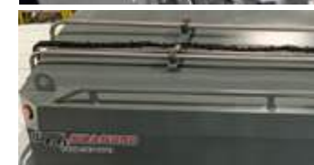
Stainless steel piping