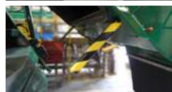
Safety prop for maintenance