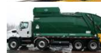
Available with compressed natural gas (CNG) side and roof mounted tanks