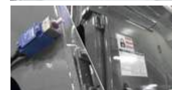
Security switch when opening the access door