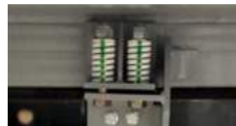
Body attachment to the chassis