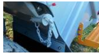
Tilgate locking system