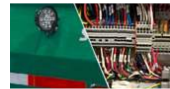
Centralized junction box.