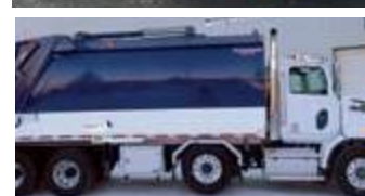
Steerable lift axle